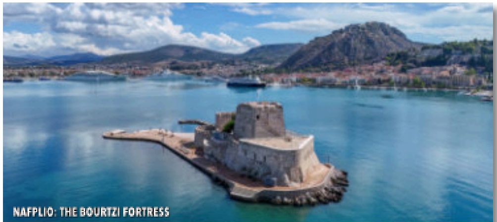
NAFPLIO: THE BOURTZI FORTRESS

See terms and conditions on application form for details.