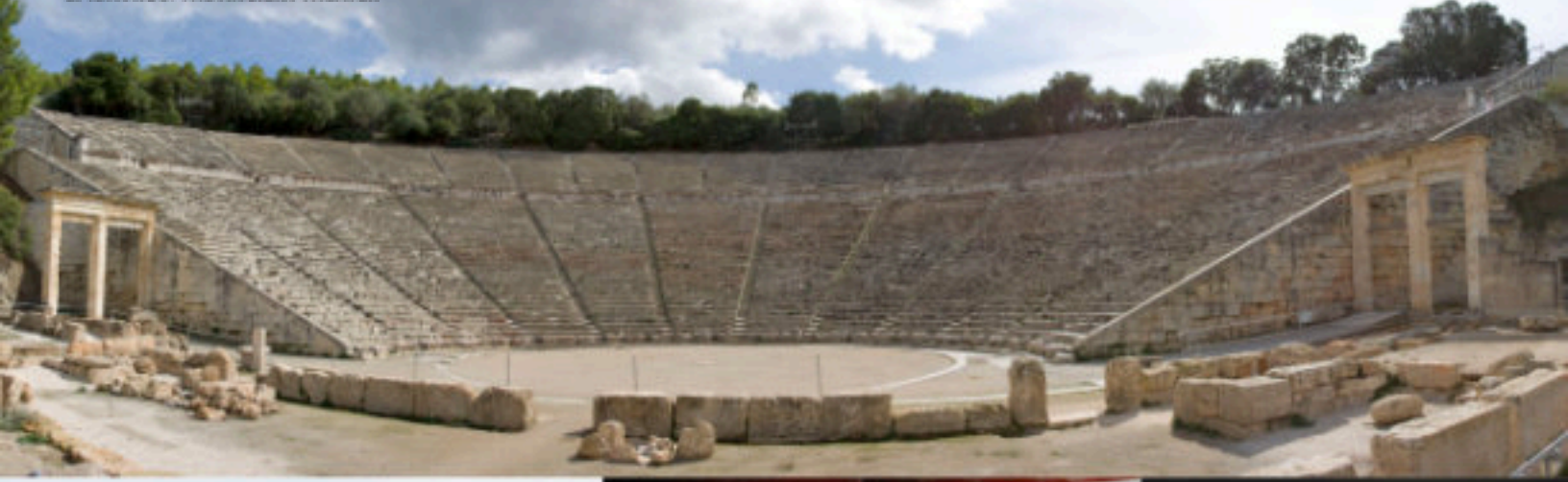
EPIDAVROS: THE ANCIENT THEATER