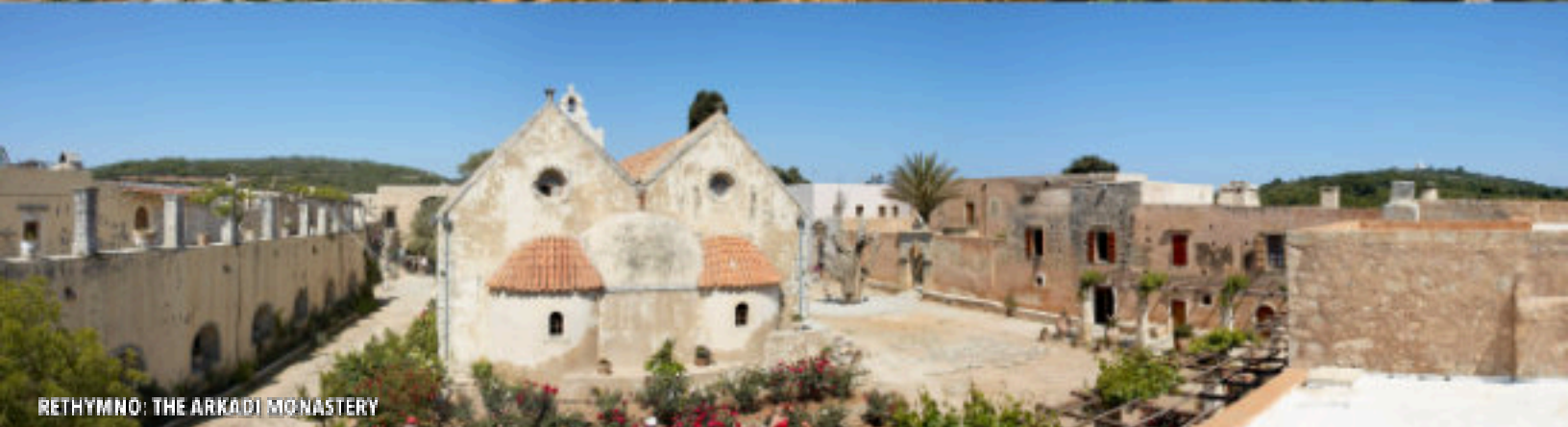
RETHYMNO: THE ARKADI MONASTERY