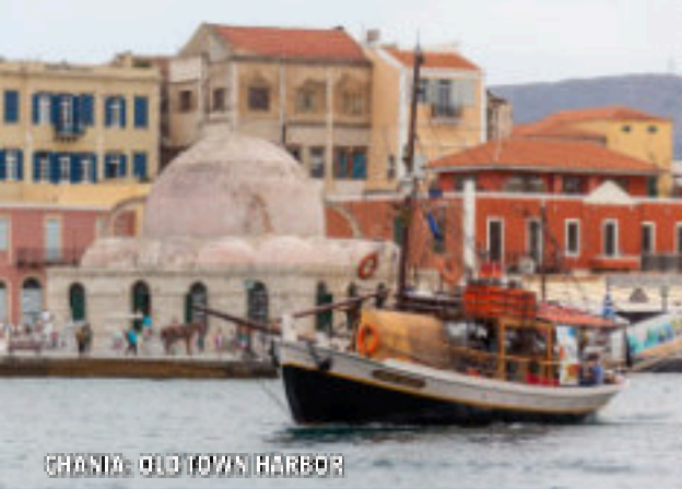
CHANIA: OLD TOWN HARBOR