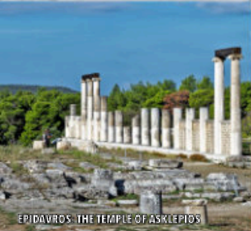
EPIDAVROS: THE TEMPLE OF ASKLEPIOS