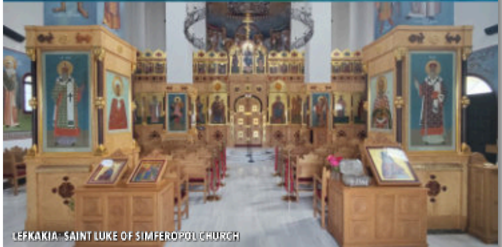
LEFKAKIA: SAINT LUKE OF SIMFEROPOL CHURCH