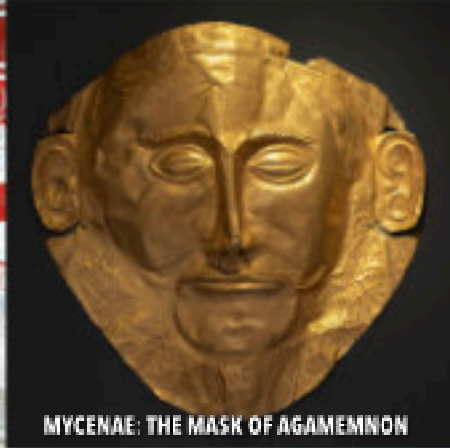
MYCENAE: THE MASK OF AGAMEMNON