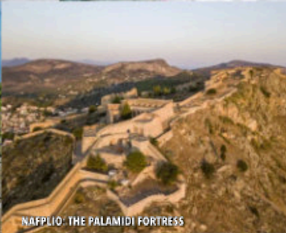
NAFLIO: THE PALAMIDI FORTRESS