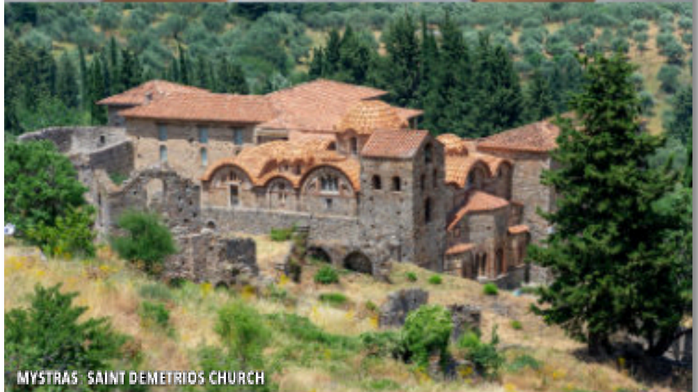
MYSTRAS: SAINT DEMETRIOS CHURCH