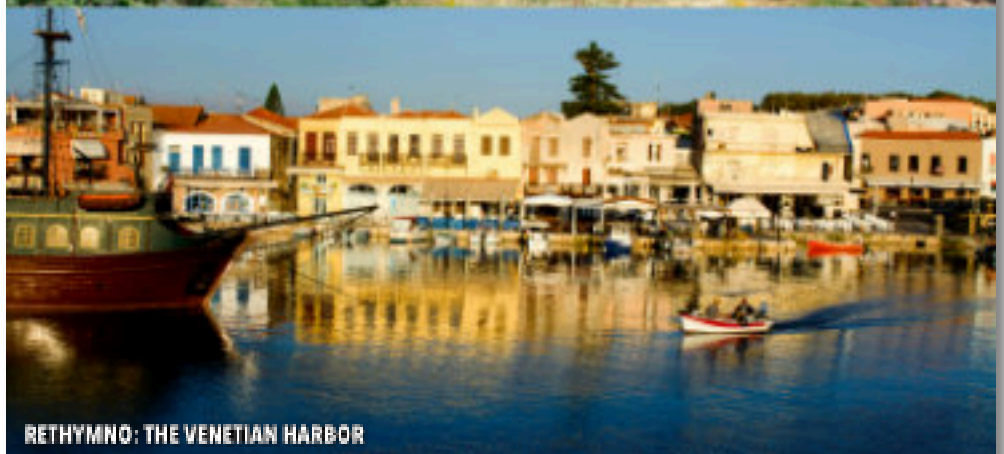
RETHYMNO: THE VENETIAN HARBOR