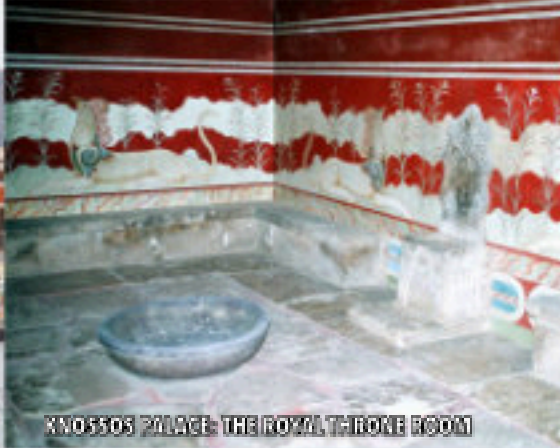
KNOSSOS PALACE: THE ROYAL THRONE ROOM