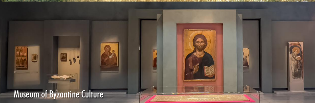
Museum of Byzantine Culture