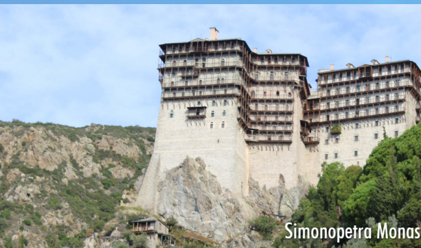
Simonopetra Monastery, Mount Athos

Specially designed for men and women to experience the Monasteries, Saints, Holiness, History and Culture of Mount Athos and Thessaloniki